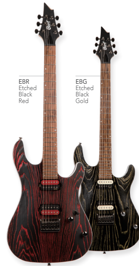
EBR Etched Black Red

Bolt-On Construction / 25.5"(648mm) Scale Ash Burl Top on Mahogany Body 5pcs Maple & Purpleheart Neck Macassar Ebony Fingerboard 15.75"(400mm) Radius / 24Frets Hardtail Bridge w/ String Thru Body Cort® Staggered Locking Tuners Fishman® Fluence Modern Humbucker Set 1 Volume(P/P), 1 Tone(P/P), 3 Way Switch Black Nickel Hardware D'Addario® EXL110 Strings