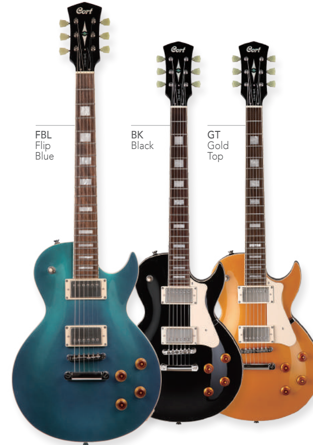
FBL Flip Blue

Set-Neck Construction / 24.75" (628mm) Scale Flamed Maple Top on Mahogany Body Mahogany Neck Jatoba Fingerboard 12" (305mm) Radius / 22Frets Tune-O-Matic Bridge w/ Stop Tailpiece Vintage Style Tuners Cort® Voiced Tone VTH59 Pickup Set 2 Volume, 2 Tone, 3 Way Switch Nickel Hardware D'Addario® EXL110 Strings