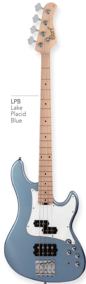
LPB Lake Placid Blue

The GB Series basses are for the modern players with a leaning towards the traditional look and feel but with modern appointments and features that improve the overall performance of the instrument.