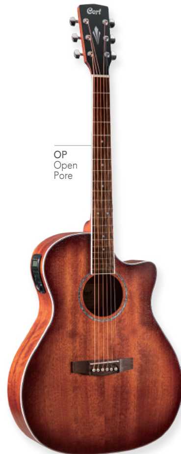
OP Open Pore