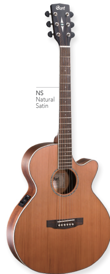
NS Natural Satin

SFX Body / 25.3"(643mm) Scale Solid Spruce Top Mahogany Back & Sides w/ Arched Back Mahogany Neck Modern "V" Shape Neck Profile Ovangkol Fingerboard Ovangkol Bridge PPS Nut & Saddle 1 11/16"(43mm) Nut Width Die-Cast Tuners w/ Black Knobs Fishman® Presys II w/ Sonicore Pickup D'Addario® EXP16 Strings