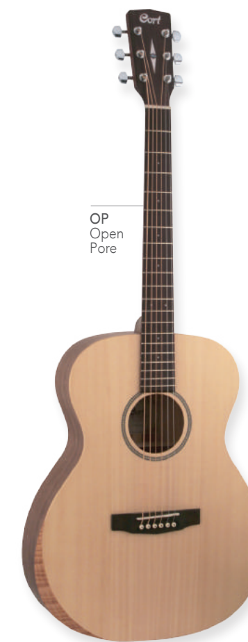
OP Open Pore

Grand Auditorium Body 25.3" (643mm) Scale Solid Sitka Spruce Top Pau Ferro Back & Sides Mahogany Neck Ovangkol Fingerboard Ovangkol Bridge w/ Ebony Pins Genuine Bone Nut & Saddle 1 11/16" (43mm) Nut Width Die-Cast Tuners w/ Black Knobs L.R. Baggs® EAS-VTC D'Addario® EXP16 Strings