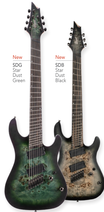
New SDG Star Dust Green

Bolt-On Construction / 25.5"-28" Multi-Scale Poplar Burl Top on Swamp Ash Body 5pcs Maple & Purple Heart Neck Macassar Ebony Fingerboard 15.75"(400mm) Radius / 24Frets Individual Bridge w/ String Thru Body Cort® Staggered Locking Tuners Fishman® Fluence Modern Humbucker Set 1 Volume(P/P), 1 Tone(P/P), 3 Way Switch Black Nickel Hardware D'Addario® EXL120 + 054 + 065 Strings