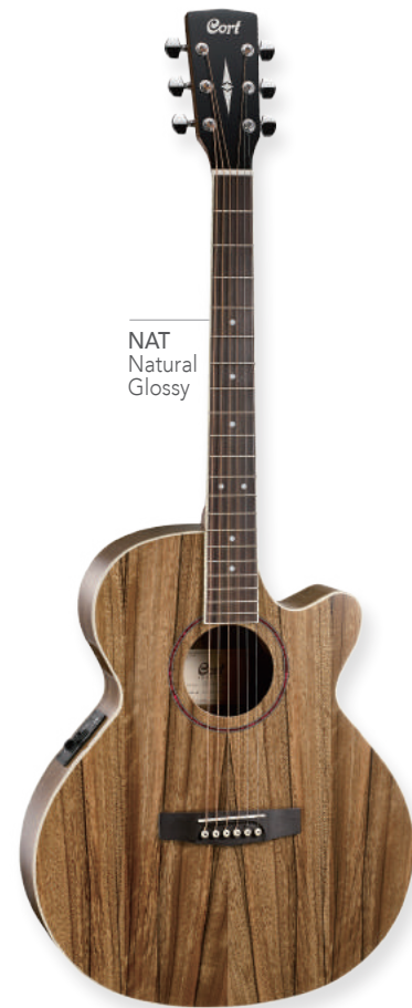
NAT Natural Glossy