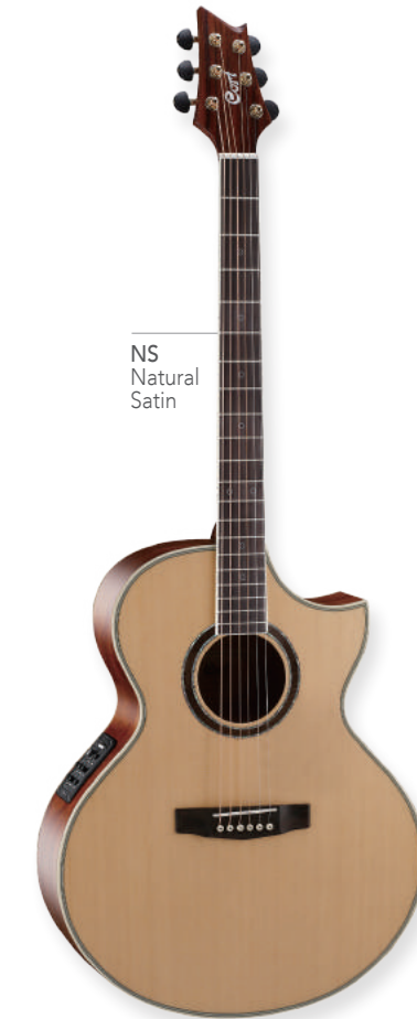
NS Natural Satin

NDX Body / 25.3"(643mm) Scale Solid Sitka Spruce Top Mahogany Back & Sides Mahogany Neck Ovangkol Fingerboard Ovangkol Bridge Genuine Bone Nut & Saddle 1 11/16"(43mm) Nut Width Grover® Gold Tuners w/ Black Knobs Fishman® Presys w/ Sonicore Pickup D'Addario® EXP16 Strings