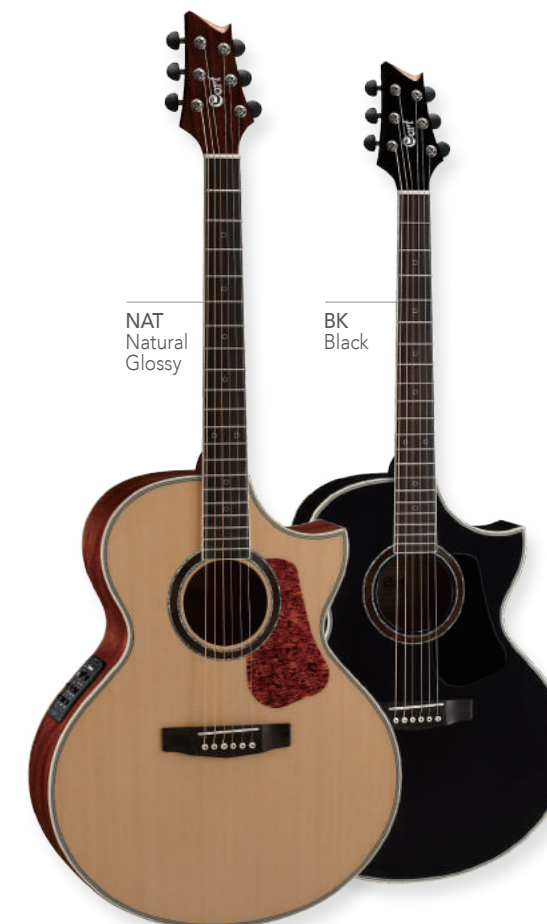
NAT Natural Glossy

NDX Body / 25.3"(643mm) Scale Solid Sitka Spruce Top Pau Ferro Back & Sides Mahogany Neck Ovangkol Fingerboard Ovangkol Bridge Genuine Bone Nut & Saddle 1 11/16"(43mm) Nut Width Grover® Gold Tuners w/ Black Knobs Fishman® Presys Blend w/ Sonicore Pickup D'Addario® EXP16 Strings