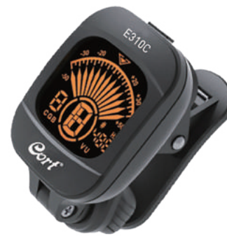
E310C Clip-on Tuner, LED Type