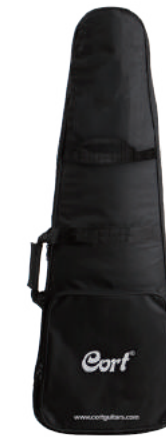
CGB31 Standard Gig Bag for Electric Guitar