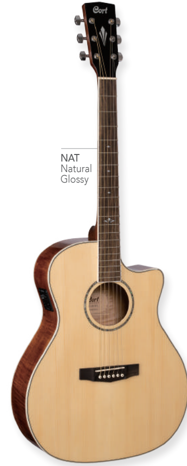
NAT Natural Glossy

Grand Auditorium Body / 25.5"(648mm) Scale Figured Maple Top Mahogany Back & Sides Mahogany Neck Laurel Fingerboard / Laurel Bridge Graph Tech® Nubone XB Nut & Saddle 1 3/4"(45mm) Nut Width Die-Cast Tuners Special Design Inlay Fishman® Presys I w/ Sonicore Pickup Coated Strings