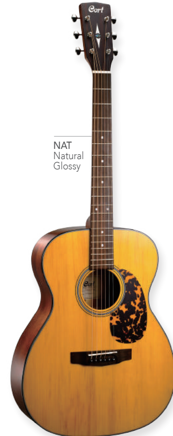
NAT Natural Glossy

Concert Body / 25.3"(643mm) Scale Solid Mahogany Top Solid Mahogany Back & Mahogany Sides Mahogany Neck Ovangkol Fingerboard Ovangkol Bridge Genuine Bone Nut & Saddle 1 11/16"(43mm) Nut Width Die-Cast Tuners w/ Black Knobs D'Addario® EXP16 Strings * L450CL - L.R. Baggs® EAS-VTC Pickup