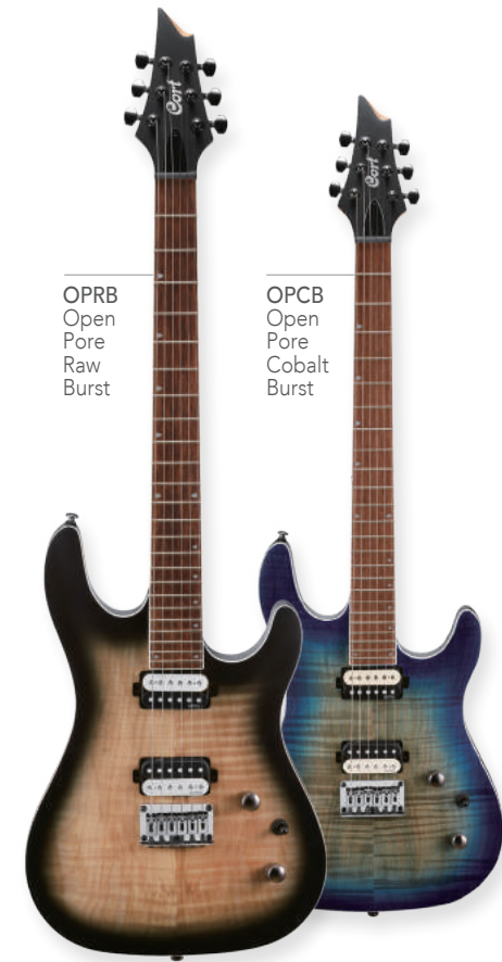
OPRB Open Pore Raw Burst

Bolt-On Construction / 25.5"(648mm) Scale Ash Top on Mahogany Body Canadian Hard Maple Neck Pau Ferro Fingerboard 15.75"(400mm) Radius / 24Frets Hardtail Bridge w/ String Thru Body Die-Cast Tuners EMG® RetroActive Super77 Pickup Set 1 Volume, 1 Tone, 3 Way Switch Black Nickel Hardware D'Addario® EXL110 Strings