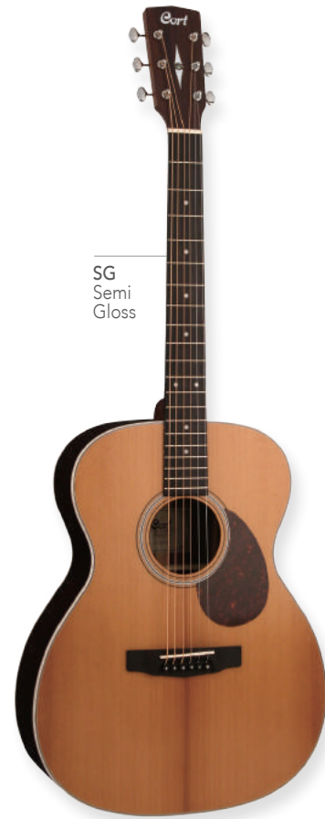
SG Semi Gloss

OM Body / 25.3"(643mm) Scale Solid Adirondack Spruce Top w/ Adirondack Bracing Solid Mahogany Back & Mahogany Sides Mahogany Neck Ovangkol Fingerboard Ovangkol Bridge Genuine Bone Nut & Saddle 1 3/4"(45mm) Nut Width Grover® Vintage Tuners Teardrop Wildcat Yellow Pickguard D'Addario® EXP16 Strings * L300VF - Fishman® Sonitone w/ Sonicore Pickup