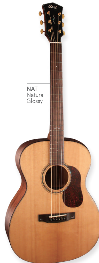
NAT Natural Glossy

Dreadnought Body / 25.3" (643mm) Scale Torrefied Solid Sitka Spruce Top Solid Mahogany Back & Sides Walnut Reinforced Mahogany Neck Macassar Ebony Fingerboard Macassar Ebony Bridge w/ Ebony Pins Genuine Bone Nut & Saddle 1 11/16" (43mm) Nut Width Deluxe Vintage Gold Tuners Sonically Enhanced UV Finish D'Addario® EXP16 Strings