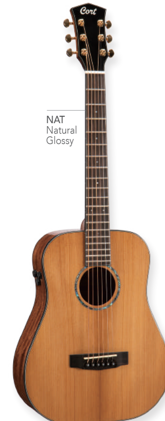
NAT Natural Glossy

OM Cutaway Body / 25.3" (643mm) Scale Torrefied Solid Sitka Spruce Top Solid Mahogany Back & Sides Walnut Reinforced Mahogany Neck Macassar Ebony Fingerboard Macassar Ebony Bridge w/ Ebony Pins Genuine Bone Nut & Saddle 1 11/16" (43mm) Nut Width Deluxe Vintage Gold Tuners Sonically Enhanced UV Finish Fishman® Flex Blend w/ Tuner & Internal Mic. D'Addario® EXP16 Strings