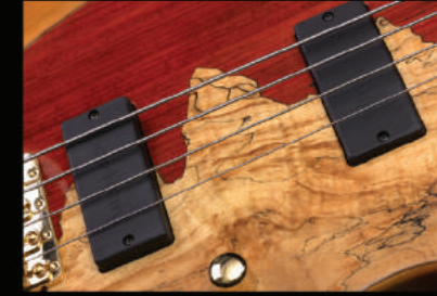
Bartolini® Jeff Berlin Custom