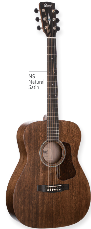
NS Natural Satin

Cort's vision of alternatives to the popular dreadnought shape, the Luce Series offers smaller body size shapes like OM, Concert and Parlor. An ideal balance between classic vintage looks from the golden age of guitars and modern yet practical features, the Luce Series guitars provide the best of both worlds in perfect harmony.