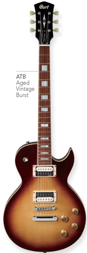
ATB Aged Vintage Burst

The CR Series delivers the look, feel and performance of the much sought-after vintage instruments from the Golden Era of electric guitars. At the heart of each CR Series guitar is the specially designed ClassicRocker pickups for an authentic vintage rock sound and response.