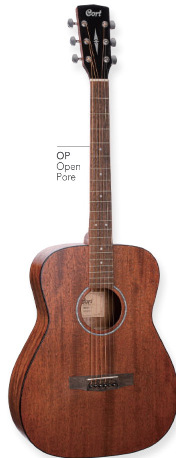
OP Open Pore