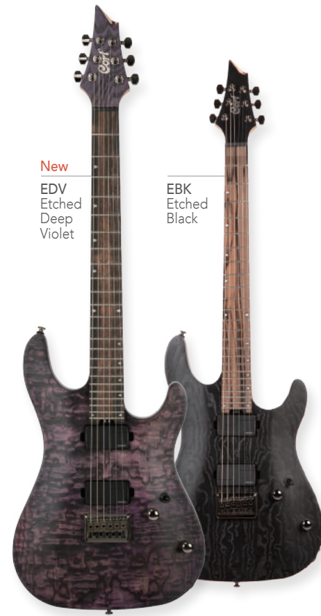
New EDV Etched Deep Violet

Bolt-On Construction / 25.5"-27" Multi-Scale Poplar Burl on Mahogany Body 5pcs Maple & Purple Heart Neck Macassar Ebony Fingerboard 15.75"(400mm) Radius / 24Frets Individual Bridge w/ String Thru Body Cort® Staggered Locking Tuners Fishman® Fluence Modern Humbucker Set 1 Volume(P/P), 1 Tone(P/P), 3 Way Switch Black Nickel Hardware D'Addario® EXL110 + NW059 Strings