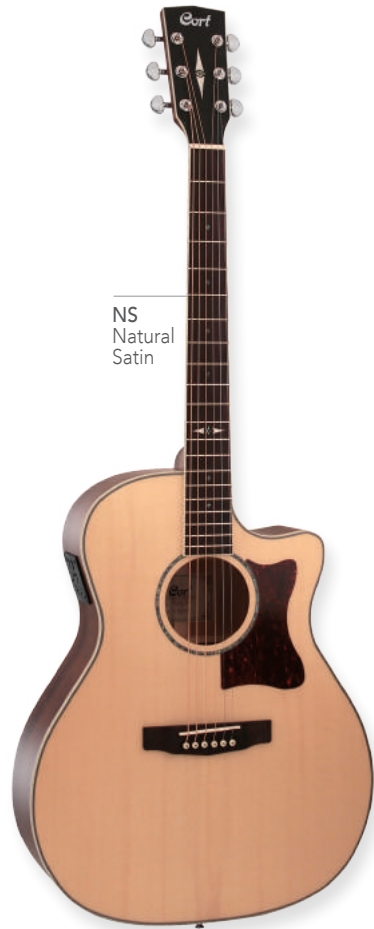
NS Natural Satin

The Grand Regal offers the comfort of a slightly smaller body, but without any compromise in sound. Our craftsmen saw to that with the perfect combination of wood, bracing, and building methods to optimize the Grand Regal.