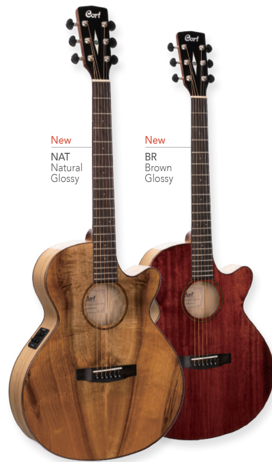
New NAT Natural Glossy

SFX Body / 25.3"(643mm) Scale Solid Engelmann Spruce Top Quilted Maple Back & Sides w/ Arched Back Mahogany Neck Modern "V" Shape Neck Profile Ovangkol Fingerboard Ovangkol Bridge PPS Nut & Saddle 1 11/16"(43mm) Nut Width Die-Cast Tuners w/ Black Knobs Fishman® Presys II w/ Sonicore Pickup D'Addario® EXP16 Strings