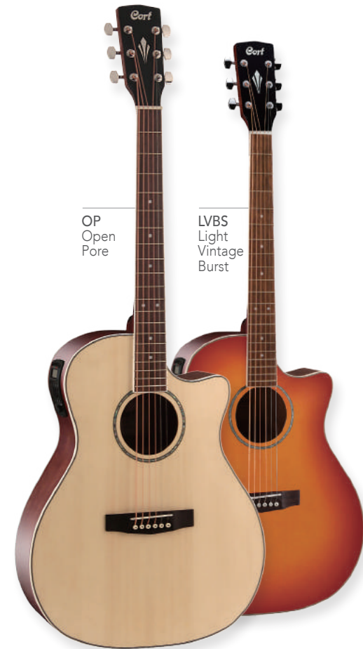
OP Open Pore

Grand Auditorium Body / 25.5" (648mm) Scale Mahogany Top Mahogany Back & Sides Mahogany Neck Merbau Fingerboard Merbau Bridge PPS Nut & Saddle 1 3/4" (45mm) Nut Width Die-Cast Tuners Cort® CE306T Electronics Coated Strings