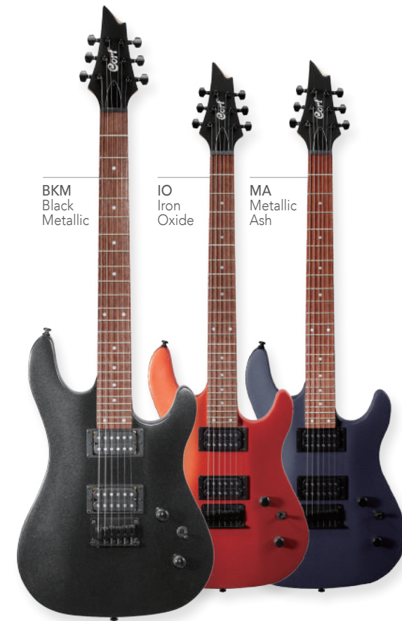
BKM Black Metallic

Bolt-On Construction / 25.5"(648mm) Scale Figured Maple Top on Mahogany Body Hard Maple Neck Jatoba Fingerboard 15.75"(400mm) Radius / 24Frets Hardtail Bridge w/ String Thru Body Die-Cast Tuners EMG® RetroActive Super77 Pickup Set 1 Volume, 1 Tone, 3 Way Switch Black Nickel Hardware D'Addario® EXL110 Strings