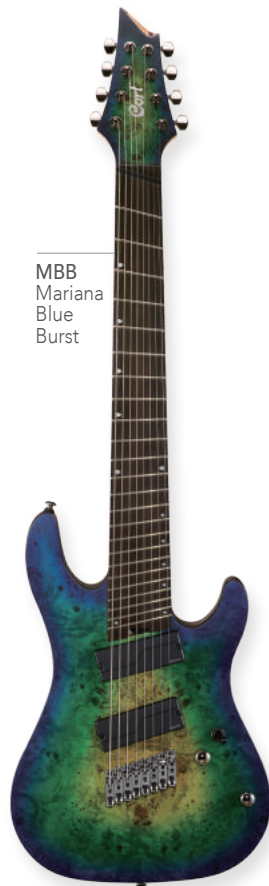
MBB Mariana Blue Burst

This double-cutaway has a deeply arched top and we designed it with easy access to the 24-fret neck.