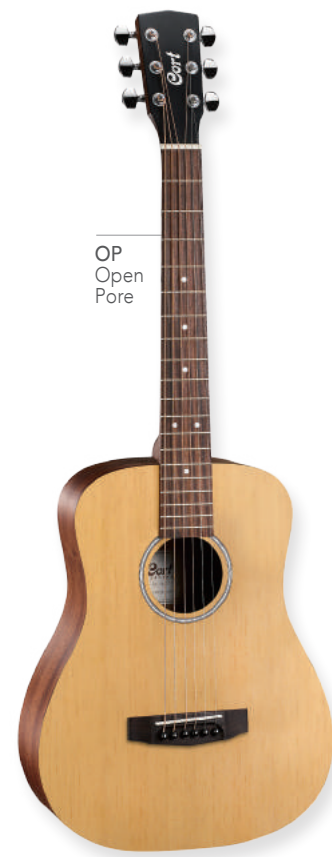
OP Open Pore

Concert Body / 25.5"(648mm) Scale Spruce Top Mahogany Back & Sides Mahogany Neck Merbau Fingerboard Merbau Bridge PPS Nut & Saddle 1 11/16"(43mm) Nut Width Die-Cast Tuners Coated Strings * AF510E - Cort® CE304T Electronics