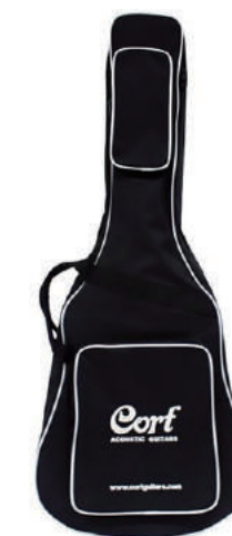
CGB38 Standard Gig Bag for Acoustic Guitar