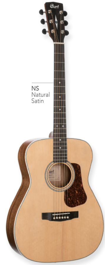
NS Natural Satin

Super Folk Body / 25.3"(643mm) Scale Solid Spruce Top Mahogany Back & Sides Mahogany Neck Ovangkol Fingerboard Ovangkol Bridge PPS Nut & Saddle 1 11/16"(43mm) Nut Width Die-Cast Tuners w/ Black Knobs Fishman® Presys II w/ Sonicore Pickup D'Addario® EXP16 Strings