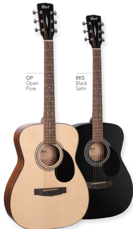
OP Open Pore

Concert Body / 25.5"(648mm) Scale Mahogany Top Mahogany Back & Sides Mahogany Neck Merbau Fingerboard Merbau Bridge PPS Nut & Saddle 1 11/16"(43mm) Nut Width Die-Cast Tuners Coated Strings