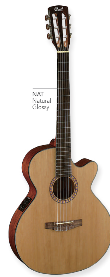
NAT Natural Glossy

SFX Body / 25.3"(643mm) Scale Solid Red Cedar Top Pau Ferro Back & Sides Mahogany Neck Ovangkol Fingerboard Ovangkol Bridge PPS Nut & Saddle 1 3/4"(45mm) Nut Width Classical Style Tuners Fishman® Presys w/ Sonicore Pickup Savarez® Cristal Corum Strings