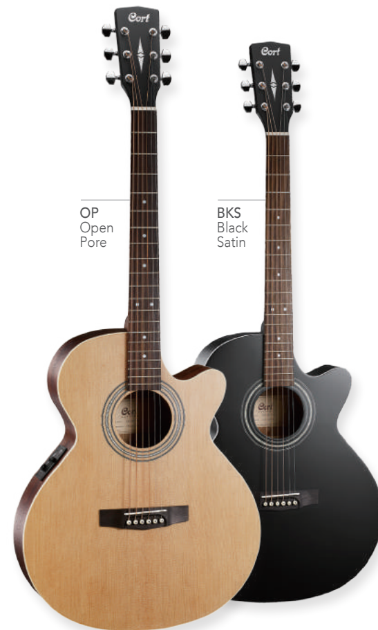
OP Open Pore

SFX Body / 25.5"(648mm) Scale Dao Top Dao Back & Sides Mahogany Neck Laurel Fingerboard Laurel Bridge PPS Nut & Saddle 1 11/16"(43mm) Nut Width Die-Cast Tuners Cort® CE304T Electronics Coated Strings