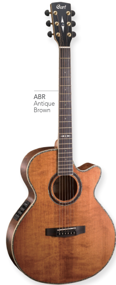
ABR Antique Brown

As Cort's vision of the modern acoustic-electric, the SFX Series features Cort's own slim body shape (83-83mm) with cutaway, modern V-shape neck profile for enhanced playability and speed, arched back for improved resonance, jumbo frets and Fishman electronics. The SFX is for the thoroughly modern player who isn't bound to tradition.