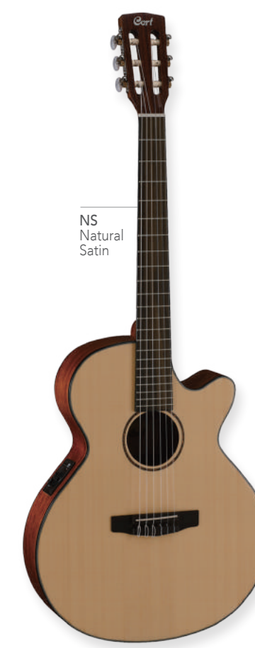
NS Natural Satin

SFX Body / 25.3"(643mm) Scale Solid Red Cedar Top Mahogany Back & Sides Mahogany Neck Ovangkol Fingerboard Ovangkol Bridge PPS Nut & Saddle 1 3/4"(45mm) Nut Width Classical Style Tuners Fishman® Presys II w/ Sonicore Pickup Savarez® Cristal Corum Strings