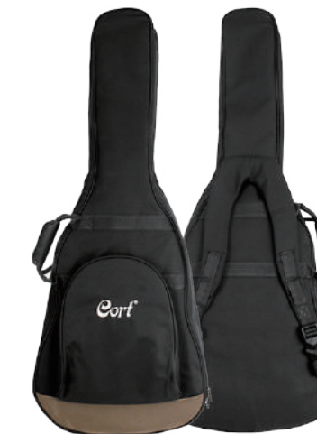
CGB67 Deluxe Gig Bag for Acoustic Guitar