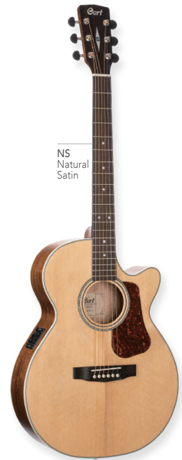
NS Natural Satin

OM Body / 25.3"(643mm) Scale Torrefied Solid Sitka Spruce Top Rosewood Back & Sides Mahogany Neck Ebony Fingerboard Ebony Bridge w/ Ebony Pins Genuine Bone Nut & Saddle 1 3/4"(45mm) Nut Width Grover® Vintage Tuners Fishman® Sonitone Pickup w/ Sonicore Pickup D'Addario® EXP16 Strings