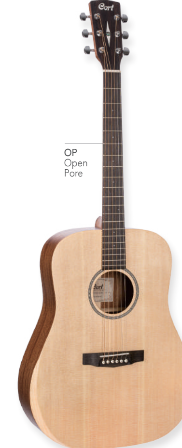
OP Open Pore

OM Body / 25.3" (643mm) Scale Solid Sitka Spruce Top Mahogany Back & Sides Mahogany Neck Ovangkol Fingerboard Ovangkol Bridge Genuine Bone Nut & Saddle 1 11/16" (43mm) Nut Width Die-Cast Tuners Herringbone Rosette D'Addario® EXP16 Strings