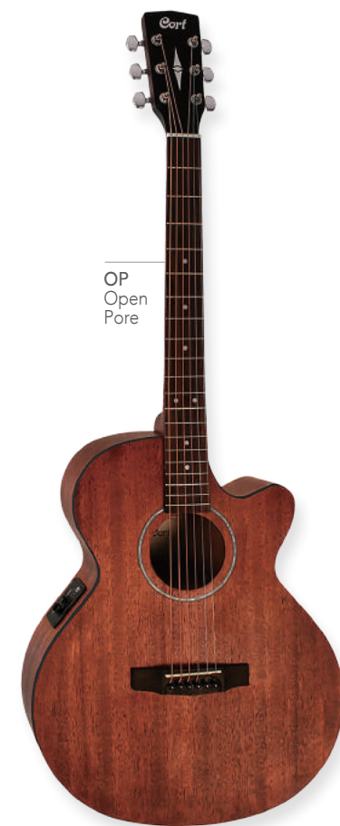
OP Open Pore

SFX Body / 25.5"(648mm) Scale Spruce Top Mahogany Back & Sides Mahogany Neck Laurel Fingerboard Laurel Bridge PPS Nut & Saddle 1 11/16"(43mm) Nut Width Die-Cast Tuners Cort® CE304T Electronics Coated Strings *12strings Available(OP), Left Handed Available(OP)