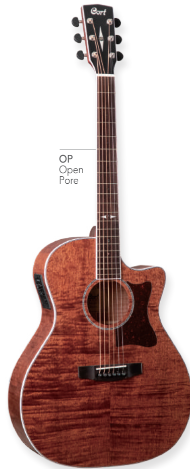
OP Open Pore

Grand Auditorium Body / 25.3"(643mm) Scale Solid European Spruce Top Madagascar Rosewood Back & Sides Mahogany Neck Ovangkol Fingerboard Ovangkol Bridge Genuine Bone Nut & Saddle 1 3/4"(45mm) Nut Width Die-Cast Tuners w/ Black Knobs Fishman® Presys w/ Sonicore Pickup D'Addario® EXP16 Strings