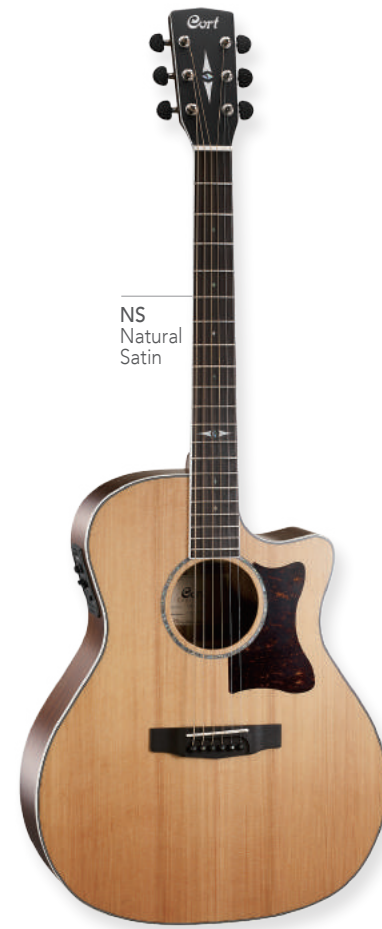
NS Natural Satin

Grand Auditorium Body / 25.3"(643mm) Scale Solid Flamed Mahogany Top Flamed Mahogany Back & Sides Mahogany Neck Ovangkol Fingerboard Ovangkol Bridge w/ Ebony Pins Genuine Bone Nut & Saddle 1 3/4"(45mm) Nut Width Die-Cast Tuners w/ Black Knobs Fishman® Presys w/ Sonicore Pickup D'Addario® EXP16 Strings