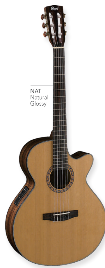
NAT Natural Glossy

The Classic Series features two distinctive types of model. The traditional style AC models have been re-engineered to improve resonance for an authentic classical guitar sound while the CEC models feature slim body with cutaway, 45mm nut width and electronics for steel-string players who love the nylon-string sound.