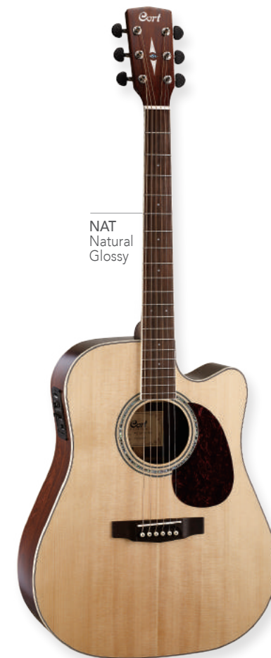
NAT Natural Glossy

Dreadnought Cutaway Body / 25.3"(643mm) Scale Solid Sitka Spruce Top Mahogany Back & Sides Mahogany Neck Ovangkol Fingerboard Ovangkol Bridge Genuine Bone Nut & Saddle 1 11/16"(43mm) Nut Width Grover® Tuners w/ Black Knobs Fishman® Presys w/ Sonicore Pickup D'Addario® EXP16 Strings * Left Handed, 12 Strings Available