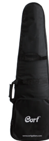
CGB36 Standard Gig Bag for Electric Bass