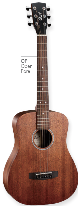
OP Open Pore

Dreadnought Body 3/4 sized Body 22.8"(578mm) Scale Spruce Top Mahogany Back & Sides Mahogany Neck Merbau Fingerboard / 19Frets Merbau Bridge PPS Nut & Saddle 1 11/16"(43mm) Nut Width White Pearl Acryl Rosette Die-Cast Tuners Coated Strings