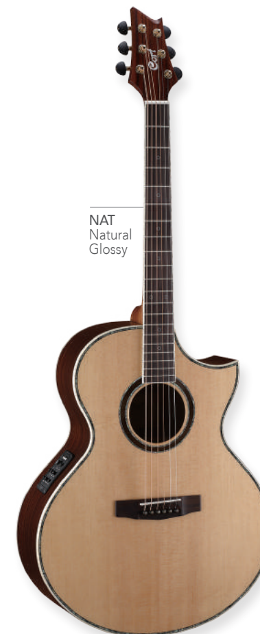
NAT Natural Glossy

A unique body shape developed exclusively by Cort, the NDX Series guitars feature a 100-125mm full-size body for a big sound, Fishman electronics for superb amplification, and a sharp Florentine cutaway for a modern look as well as easy access to the highest frets.