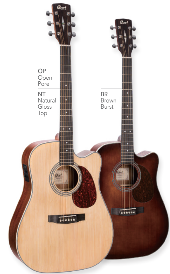
OP Open Pore

Dreadnought Cutaway Body / 25.3"(643mm) Scale Solid Spruce Top Mahogany Back & Sides Mahogany Neck Ovangkol Fingerboard Ovangkol Bridge PPS Nut & Saddle 1 11/16"(43mm) Nut Width Die-Cast Tuners Fishman® Presys II w/ Sonicore Pickup D'Addario® EXP16 Strings