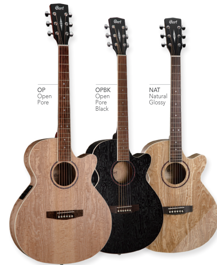
OP Open Pore

SFX Body / 25.3"(643mm) Scale Solid Spruce Top Mahogany Back & Sides Mahogany Neck Modern "V" Shape Neck Profile Ovangkol Fingerboard Ovangkol Bridge PPS Nut & Saddle 1 11/16"(43mm) Nut Width Die-Cast Tuners w/ Black Knobs Cort® CE304T Electronics D'Addario® EXP16 Strings