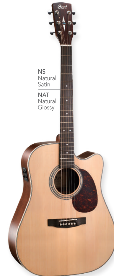
NS Natural Satin

Dreadnought Cutaway Body / 25.3"(643mm) Scale Solid Sitka Spruce Top Madagascar Rosewood Back & Sides Mahogany Neck Ovangkol Fingerboard Ovangkol Bridge Genuine Bone Nut & Saddle 1 11/16"(43mm) Nut Width Grover® Tuners w/ Black Knobs Fishman® Presys w/ Sonicore Pickup D'Addario® EXP16 Strings