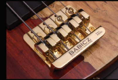
Babicz® Full Contact Bridge