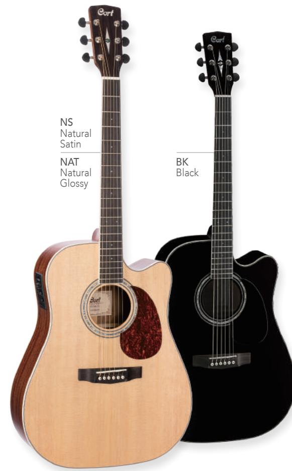
NS Natural Satin

Dreadnought Cutaway Body / 25.3"(643mm) Scale Solid Sitka Spruce Top Solid Mahogany Back & Mahogany Sides Mahogany Neck Ovangkol Fingerboard Ovangkol Bridge Genuine Bone Nut & Saddle 1 11/16"(43mm) Nut Width Grover® Tuners w/ Black Knobs Premium Double Abalone Rosette Fishman® Prefix Plus T w/ Matrix Pickup D'Addario® EXP16 Strings