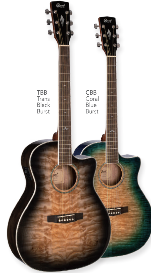
TBB Trans Black Burst

Grand Auditorium Body / 25.3"(643mm) Scale Solid Cedar Top Blackwood Back & Sides Mahogany Neck Ovangkol Fingerboard Ovangkol Bridge w/ Ebony Pins Genuine Bone Nut & Saddle 1 3/4"(45mm) Nut Width Die-Cast Tuners w/ Black Knobs Fishman® Presys w/ Sonicore Pickup D'Addario® EXP16 Strings