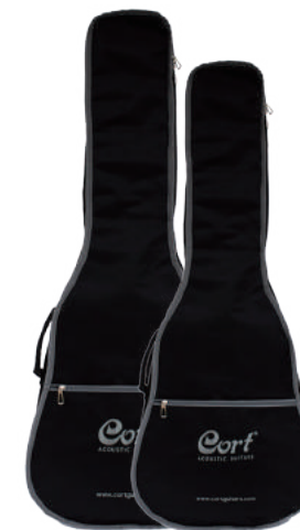
CGB18 / 18S Economy Gig Bag for Acoustic Guitar