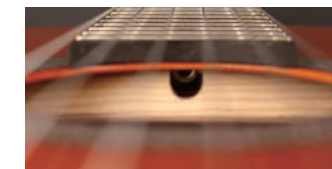
Truss Rod Inserted

Thinline Classical Body / 25.6"(650mm) Scale Spruce Top Macassar Ebony Back & Sides Mahogany Neck (Truss Rod Inserted) Laurel Fingerboard / 19Frets Laurel Bridge Urea Nut & Saddle 2 1/16"(52mm) Nut Width Classical Style Tuners Fishman® Presys II w/ Sonicore Pickup Savarez® Cristal Corum Strings