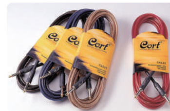
CA525 Nude Noiseless Cable 4.5m (15ft) Trans Red Trans Black Trans Blue Trans Natural