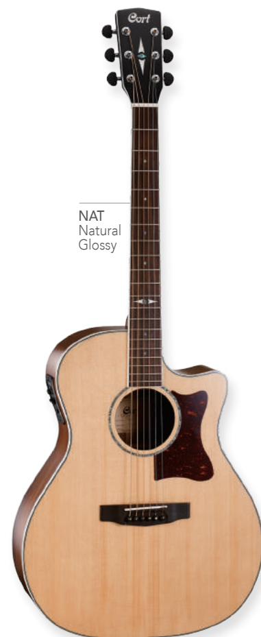
NAT Natural Glossy

Grand Auditorium Body / 25.3"(643mm) Scale Solid European Spruce Top Solid Mahogany Back & Mahogany Sides Mahogany Neck Ovangkol Fingerboard Ovangkol Bridge Genuine Bone Nut & Saddle 1 3/4"(45mm) Nut Width Die-Cast Tuners Fishman® Inkbody D'Addario® EXP16 Strings