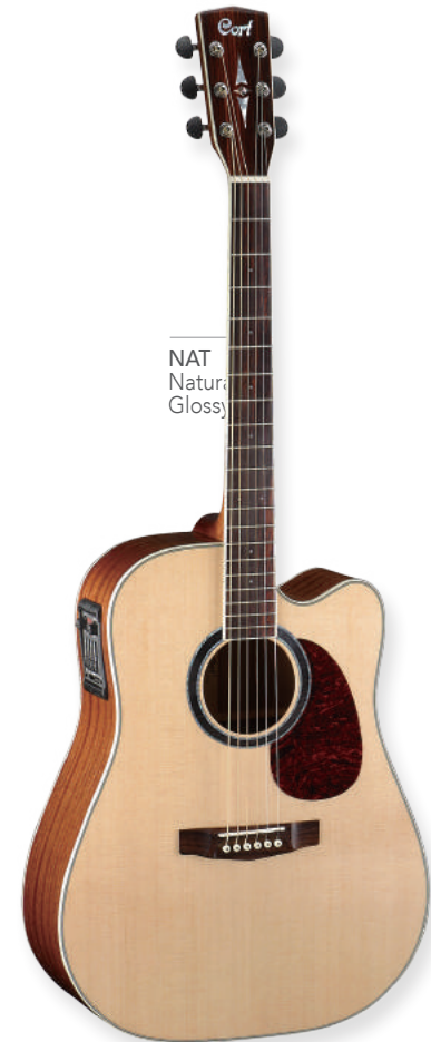
NAT Natural Glossy

The MR Series represents Cort's mission to provide the highest quality traditional instruments with superb workmanship and modern features at an unbeatable value. The classic dreadnought body has a Venetian cutaway for easy high fret access and is equipped with Fishman electronics to deliver the MR's natural acoustic sound to an amplification system.