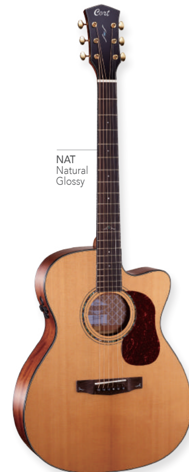
NAT Natural Glossy

OM Body / 25.3" (643mm) Scale Torrefied Solid Sitka Spruce Top Solid Mahogany Back & Sides Walnut Reinforced Mahogany Neck Macassar Ebony Fingerboard Macassar Ebony Bridge w/ Ebony Pins Genuine Bone Nut & Saddle 1 3/4" (45mm) Nut Width Deluxe Vintage Gold Tuners Sonically Enhanced UV Finish D'Addario® EXP16 Strings