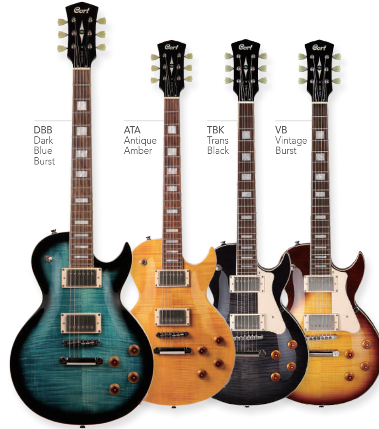
DBB Dark Blue Burst

Set-Neck Construction / 24.75" (628mm) Scale 15mm Maple Top on Mahogany Body Mahogany Neck Jatoba Fingerboard 12" (305mm) Radius / 22Frets Tune-O-Matic Bridge w/ Stop Tailpiece Vintage Style Tuners EMG® Retroactive Fat55 Pickup Set 2 Volume, 2 Tone, 3 Way Switch Chrome Hardware D'Addario® EXL110 Strings