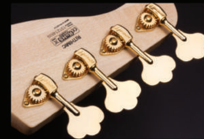
Hipshot® Ultralite Tuners

Alder Body w/ Walnut Burl Top Canadian Hard Maple Neck Ebony Fingerboard Bartolini® Jeff Berlin Custom Soapbar Pickups Babicz® FCH5(Full Contact Hardware) Gold Bridge 1 Volume, 1 Balance, 1 Tone Hipshot® Ultralite Tuners GD(Gold) Hardware DR® DDT(40-120) Strings Color : NAT(Natural)