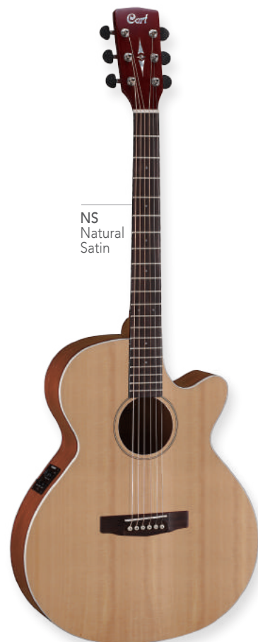
NS Natural Satin

SFX Body / 25.3"(643mm) Scale Solid Myrtlewood Top Myrtlewood Back & Sides w/ Arched Back Mahogany Neck Modern "V" Shape Neck Profile Ovangkol Fingerboard Ovangkol Bridge PPS Nut & Saddle 1 11/16"(43mm) Nut Width Die-Cast Tuners w/ Black Knobs Fishman® Presys II w/ Sonicore Pickup D'Addario® EXP16 Strings