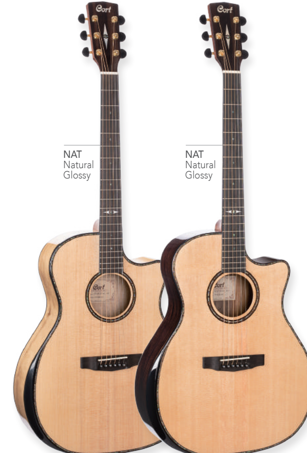
NAT Natural Glossy

A comfortable armrest named the Bevel Cut, this ergonomic feature is built into the guitar body to offer a more relaxed and rewarding playing experience. A set of player-friendly touches like a new beveled cutaway and an armrest for an unmatched blend of sound and feel.