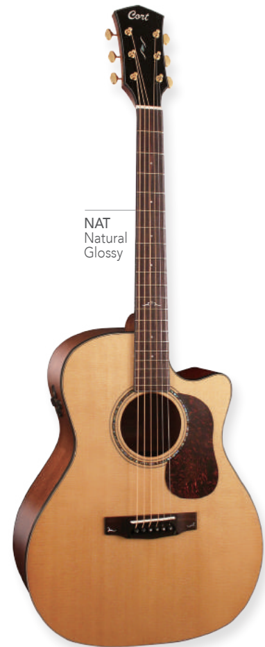
NAT Natural Glossy