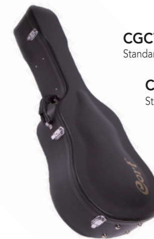
CGC77-D Standard Hard Case for Dreadnought