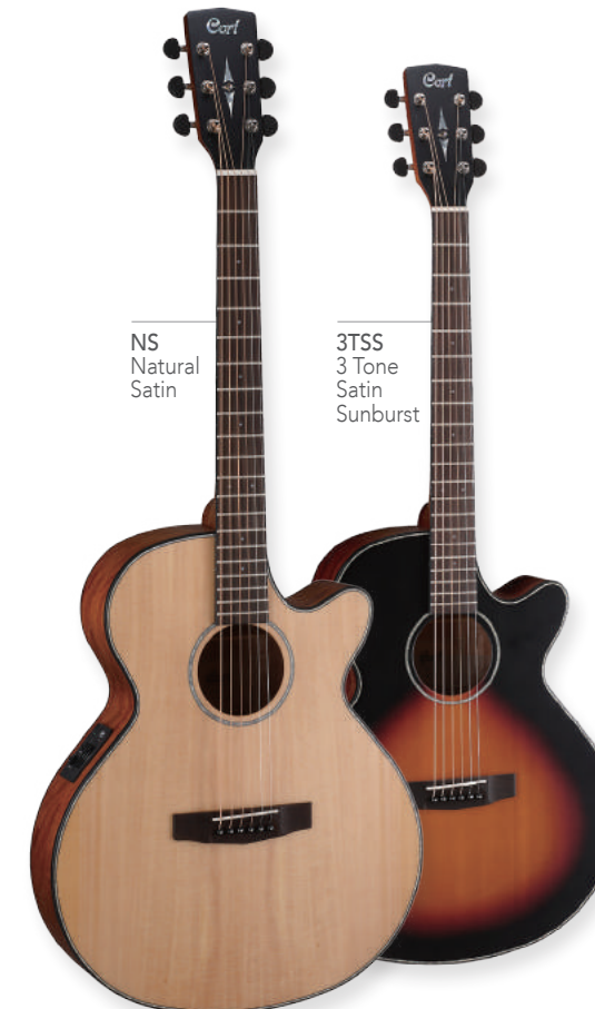
NS Natural Satin

SFX Body / 25.3"(643mm) Scale Solid Red Cedar Top Solid Mahogany Back & Mahogany Sides Mahogany Neck Modern "V" Shape Neck Profile Ovangkol Fingerboard Ovangkol Bridge PPS Nut & Saddle 1 11/16"(43mm) Nut Width Die-Cast Tuners w/ Black Knobs Fishman® Presys II w/ Sonicore Pickup D'Addario® EXP16 Strings